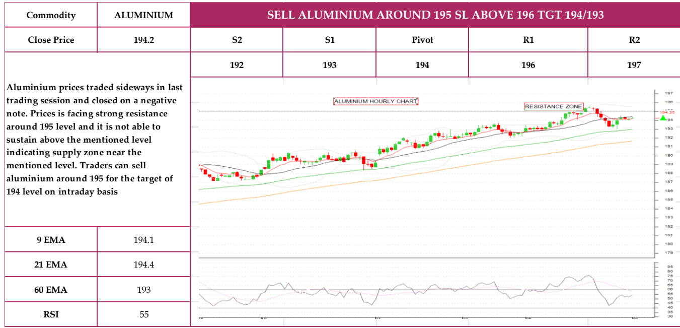
Chart of the day